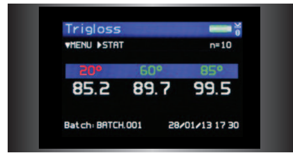
Pass / fail parameters can be defined for instant identification of non-conformances.

Graphical reporting for quick trend analysis.