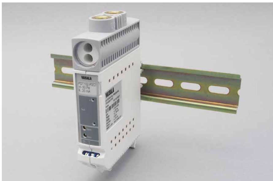
Vaisala Differential Pressure Transmitter PDT102 with process valve actuator and test jacks.