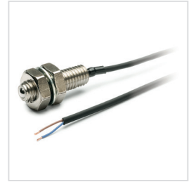
2 Type S normally open O normally closed